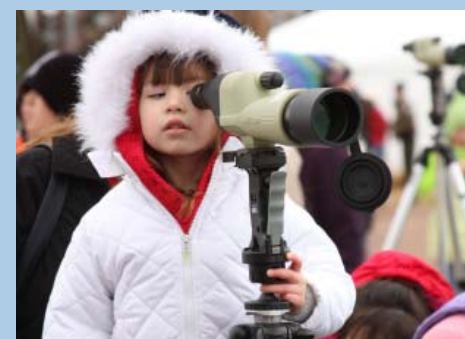
Eagle Days on the Old Chain of Rocks Bridge is one of the region's largest conservation education events. It provides a great opportunity to view wintering Bald Eagles along the Mississippi River.