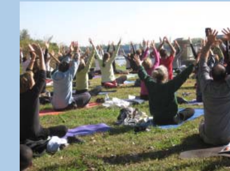
The first "Yoga at The Confluence" event held on October 4, 2009 drew new visitors to Columbia Bottom Conservation Area to celebrate the meeting of the rivers.