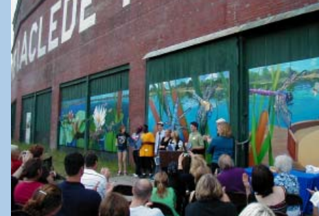
Dedication of the new mural designed and painted by Logos School students in the summer 2009 at the Laclede Power Building on the St. Louis riverfront.

For more information www.confluencegreenway.org