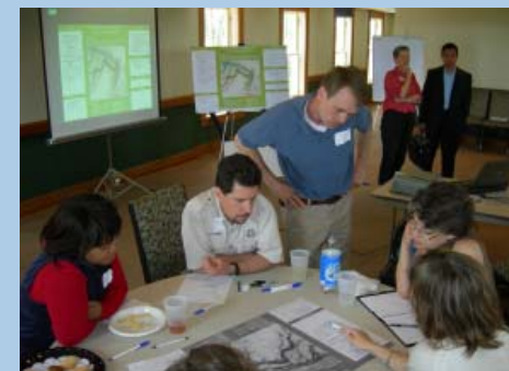
Workshop #1 for The Confluence 2020 Action Plan. The Confluence Partnership reviewed accomplishments for the past ten years and contributed to the vision for the next ten years.