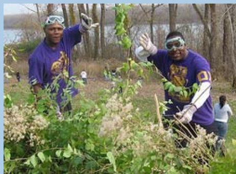
Tackling the problem of invasive bush honeysuckle along the Mississippi River on the Riverfront Trail in November 2009.