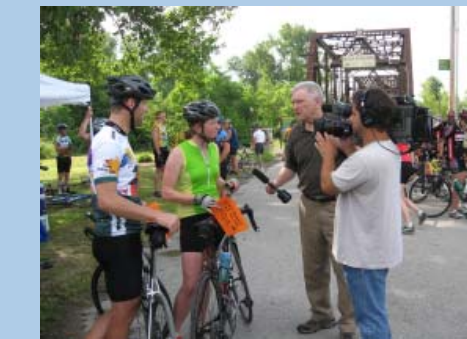
The Confluence Partnership, Trailnet, KWMU, and the Saint Louis Brewery jointly sponsored the Bridge Birthday Bash and Bicycle Ride at the Old Chain of Rocks Bridge on June 28, 2009.