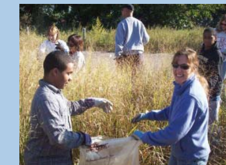
Volunteers from Monsanto and the Grace Hill AmeriCorps Trail Rangers beautify the Riverfront Trail by planting native switch grass on September 30, 2009.