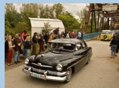
More than 3500 people enjoyed a day of classic cars, great music and road food at the 2nd St. Louis Route 66 Festival on October 3, 2009 at the Old Chain of Rocks Bridge.